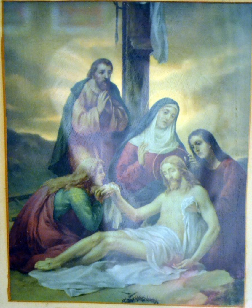
XIII Jesus is taken down from the cross.