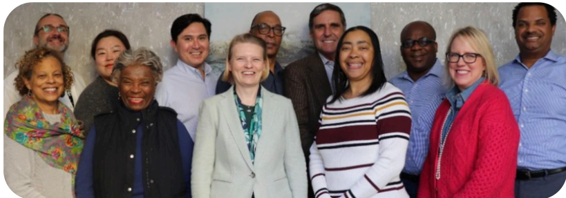
GOL Board in Texas

2023 saw the continued growth and integration of the new Lay Leader network at GOL while our original network expanded on its rich beginnings.