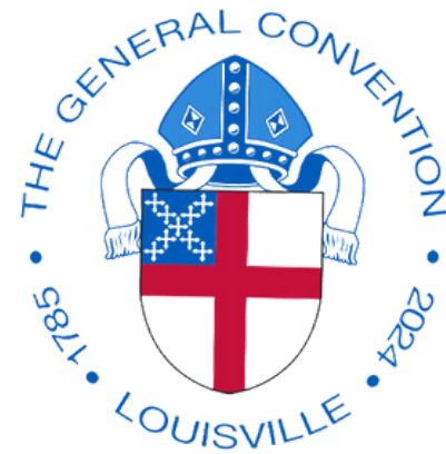
GOL on the ground at GenCon24