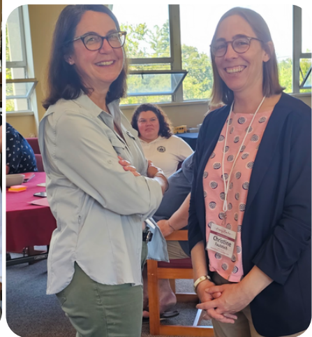
Clergy Gathering @ San Francisco