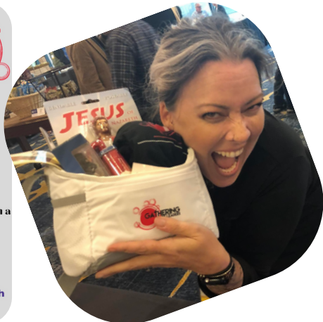
GOL @ EPN