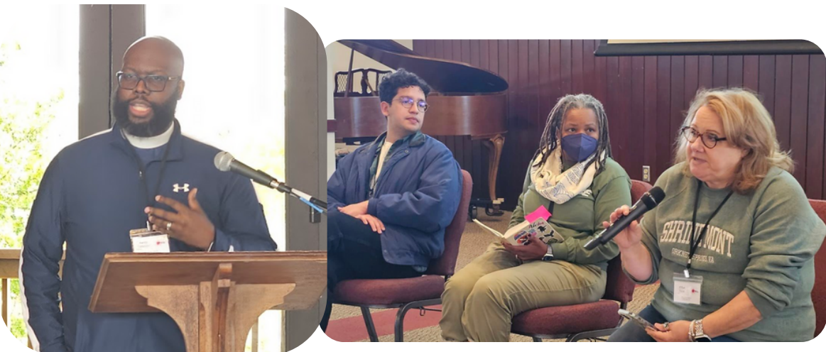
Clergy Gathering @ Maryland