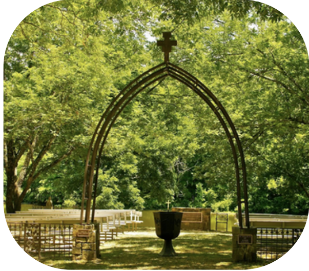
Lay Gathering at St. Columba, Memphis