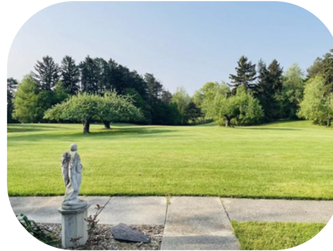
Clergy Gathering at St. Francis, Michigan