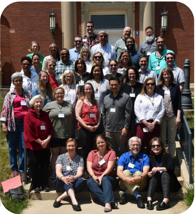
Lay Gathering @ Chicago