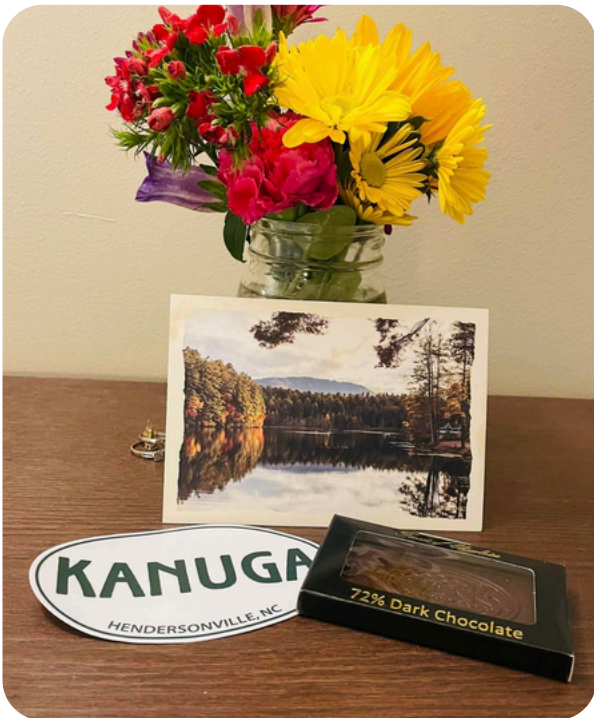
Clergy Gathering @ Kanuga