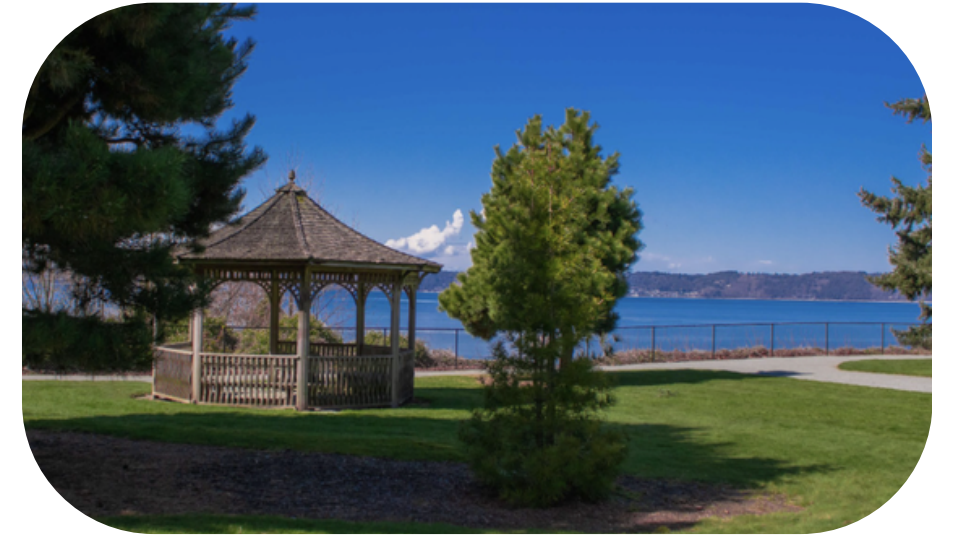
Clergy Gathering at Dumas, Washington