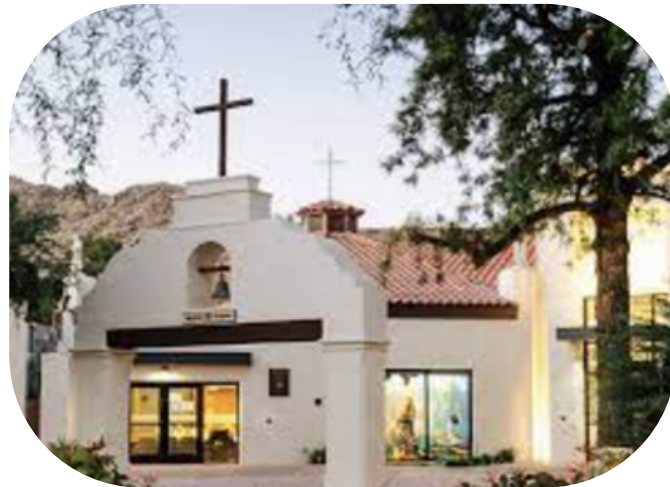
Lay Gathering at Franciscan Renewal Center, Scottsdale

Recent years, including the Covid-19 pandemic and global and national events, have brought the church into new and often post-traumatic contexts for mission, ministry, and evangelism. How have these changes impacted the way you meet Jesus, proclaim the gospel, and form disciples in your context? What failures and successes have you learned from during times of acute change? What burdens must we lay down to make space for renewal, refreshment and hope for ourselves and for others? Where do you find – or offer – creativity, innovation, growth in the current moment, and for the future?